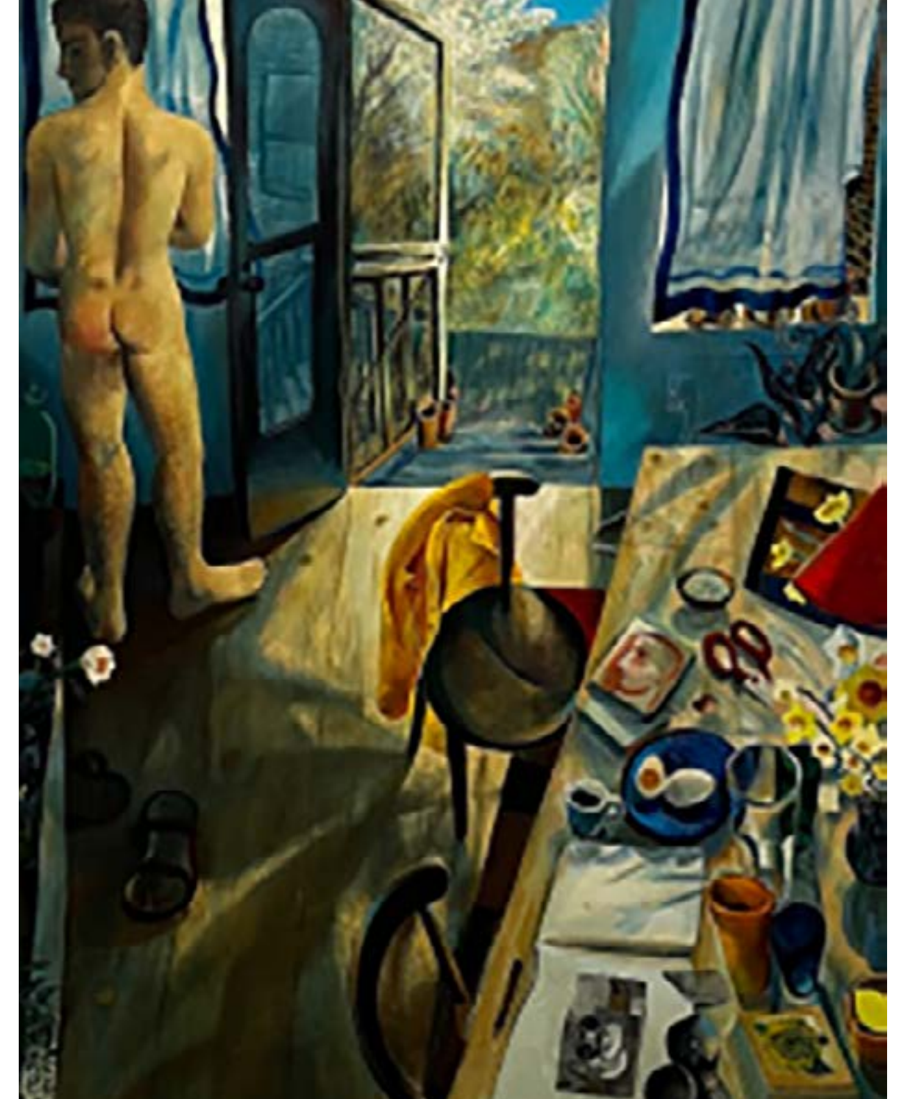
Photo 4 Louis Fratino, April (after Christopher Wood), 2024, 'Stranieri Ovunque' - 'Foreigners Everywhere'. Photo © 2024 Rui Goncalves Cepeda

Photo 3 installation view of the room at the Central Pavilion (Gardini) with Kang Seung Lee (foreground) and Romany Eveleign (background) works, 'Stranieri Ovunque' - 'Foreigners Everywhere'. Photo © 2024 Rui Goncalves Cepeda