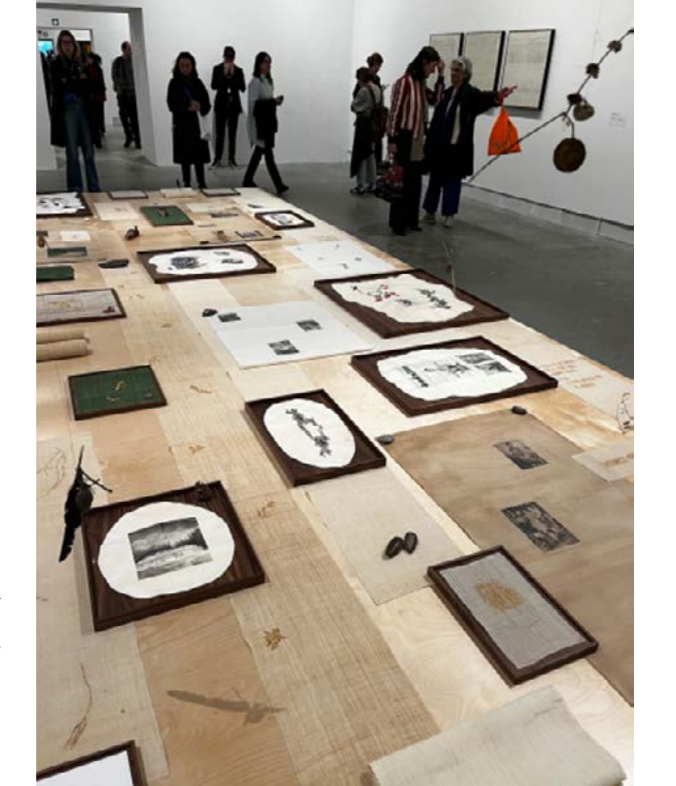
Photo 3 installation view of the room at the Central Pavilion (Gardini) with Kang Seung Lee (foreground) and Romany Eveleign (background) works, 'Stranieri Ovunque' - 'Foreigners Everywhere'.